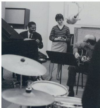
John Lewis with Nancy Harrow & Jim Hall