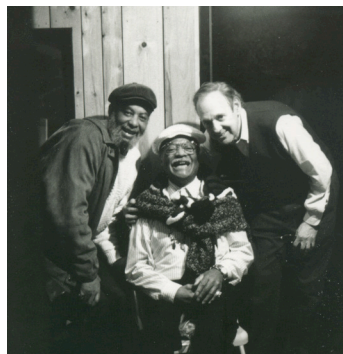
Ben Riley, Clark Terry & Dick Katz